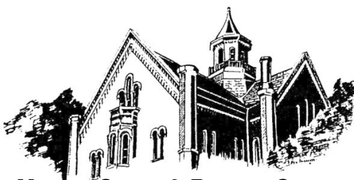
Merom Camp & Retreat Center